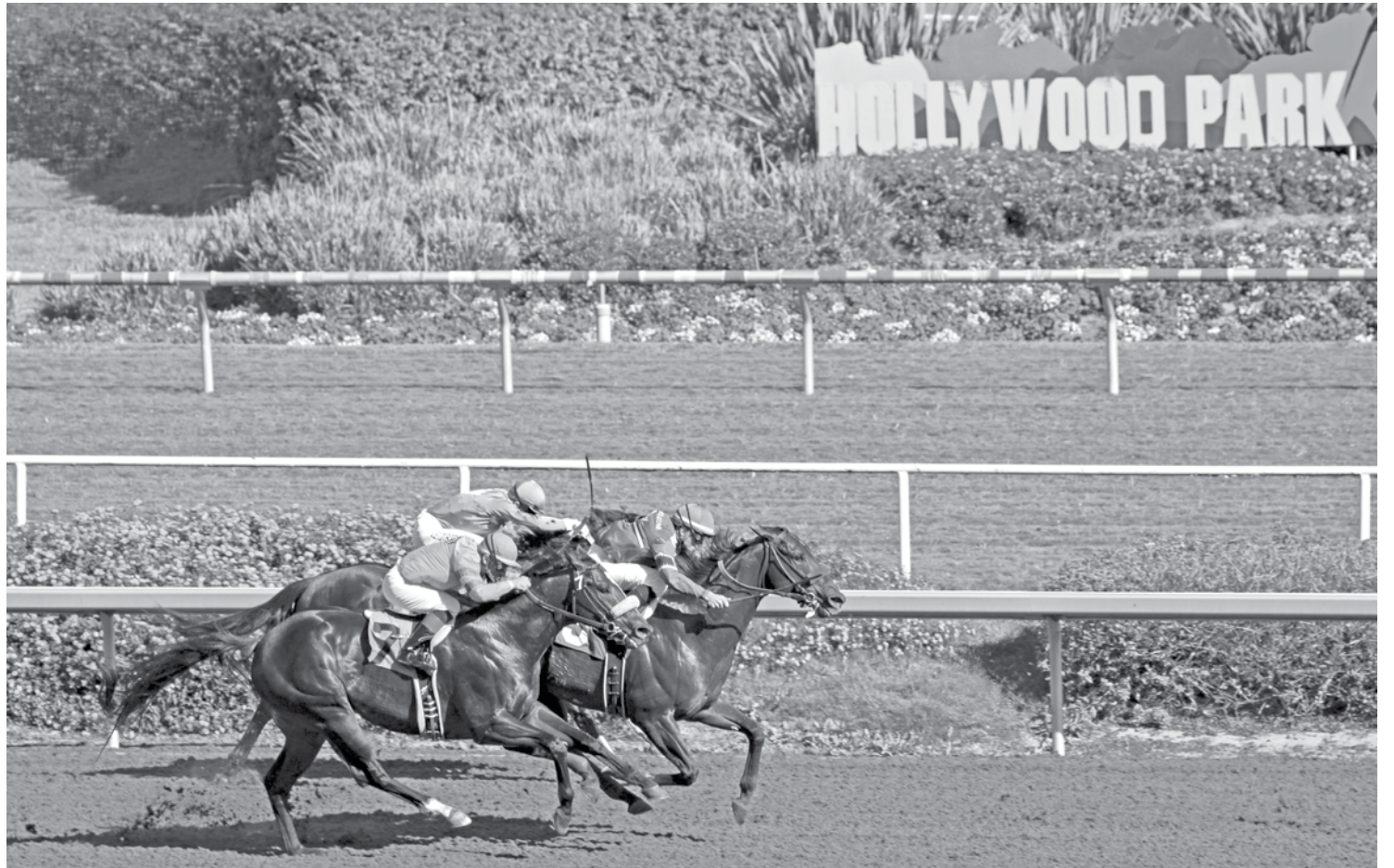
Hollywood Park closes after 75 years. Much of the track's items, including artwork and memorabilia, tractors and restaurant equipment, will be auctioned on Jan. 24-25.